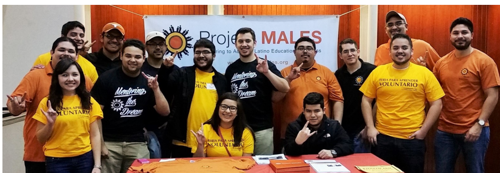
A few of Project MALES student mentors and staff at Austin's Feria Para Aprender, February 2015